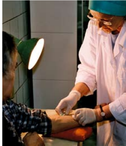
Photos: Clinicians in Russia work on laboratory results for and provide care to MDR-TB patients.

“We could not shy away from an opportunity to bring hope to tens of thousands of people living with AIDS, tuberculosis, and malaria, and countless others whose lives are distorted by the grim reality of genocide, poverty, violence, hunger, and landlessness. These are people who often feel their suffering has gone unnoticed by the rest of the world.”