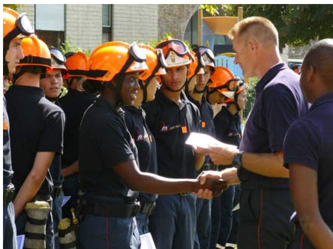
Firemen of Paris, certificate ceremony

Within its corporate patronage, the Réunica Prévoyance foundation supports educational projects designed to remotivate youngsters through both a learning and a professional qualification course. Both projects, described below, are supported by the Réunica Prévoyance foundation. They seek this goal based on very different structures.