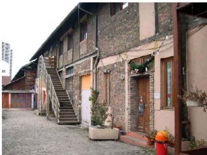
A restaurant managed by the association Le Relais for a program of work integration social enterprise in catering field

The Aéroports de Paris foundation was created under the auspices of Fondation de France with the aim of supporting initiatives to develop local solidarity.