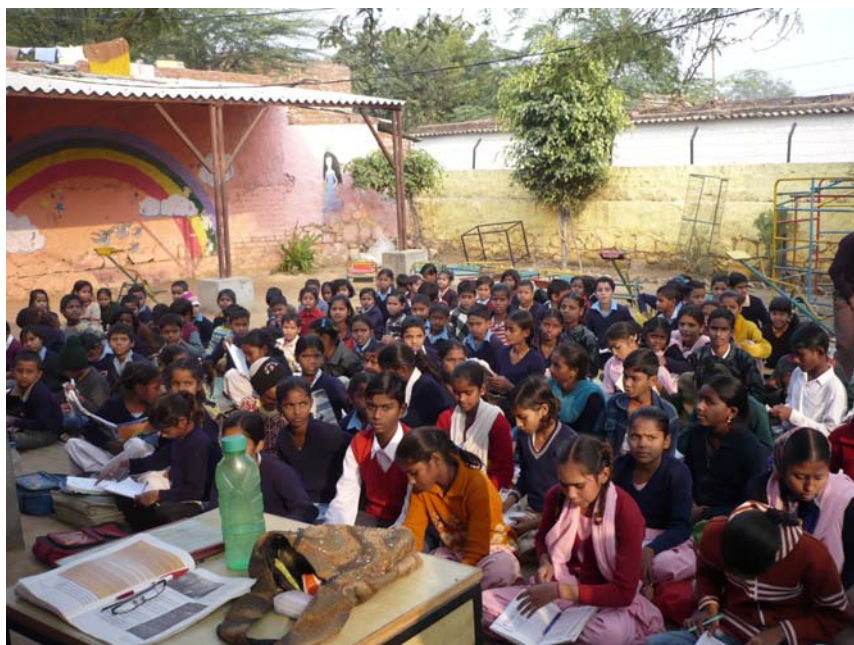
SOS Children's Village in India